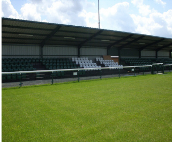
The Main Stand at the Carlsberg Stadium Home of Southill Alexander Football Club

Southill Alexander also known as 'The Bishops' will become a strong brand in its own right and a great platform to develop your companies commercial and social aspirations.